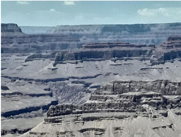
The Grand Canyon