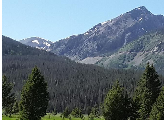
The Rocky Mountains