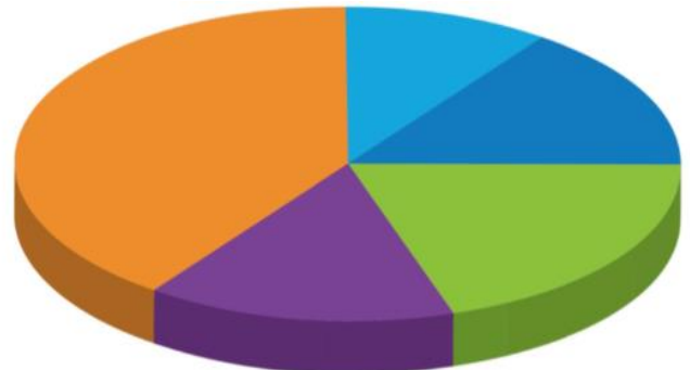
The Traditional Fund is made up of the following asset classes: